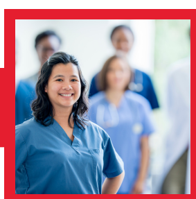
General Nurses (RGN/RMN)