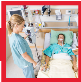
Intensive care Nurses