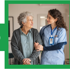
Senior Healthcare Assistants