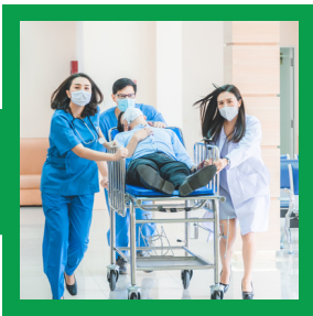
Accident and Emergency Nurses